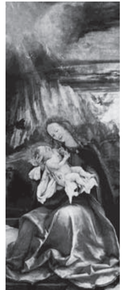
Matthias Grünewald, The Isenheim Altar - Detail from the Nativity panel